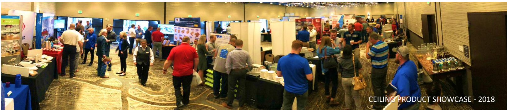
CEILING PRODUCT SHOWCASE - 2018